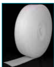
JCW White Edging Strip